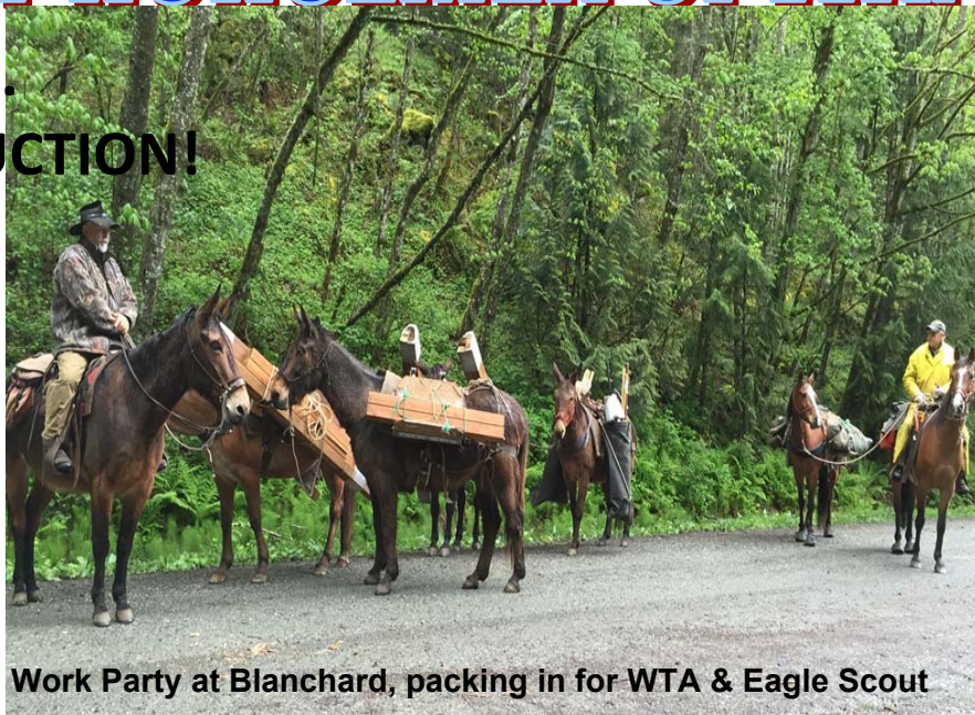
Work Party at Blanchard, packing in for WTA & Eagle Scout